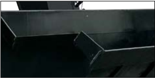
Strong & very resistant structure